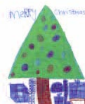
Tree with presents