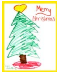
Tree with heart