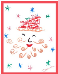
Santa with curly beard

Name: _____ Address: _____ City: _____ State _____ Zip _____ Telephone: _____ Fax: _____ Email: _____