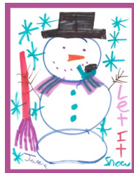
Let it Snow