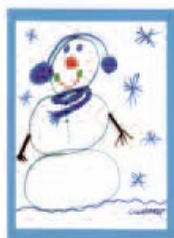
Snowman with earmuffs